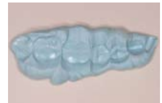
Blue Velvet Bite Registration

The specified intraoral set times are the minimum time the material should remain in the mouth based on an oral temperature of 93° F / 34° C.